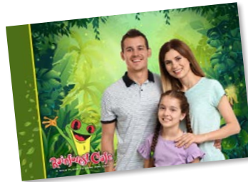
4" x 6" Postcard size