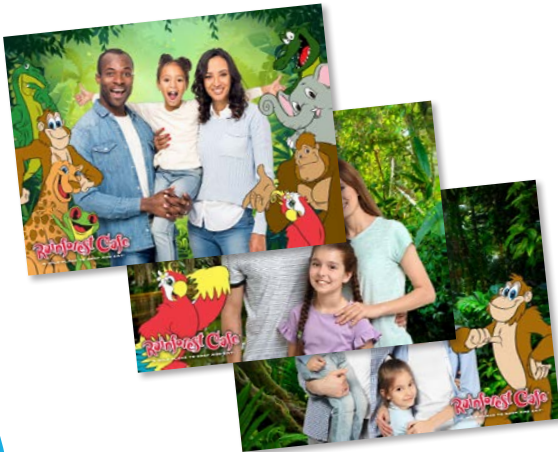
6" x 8" Postcard size