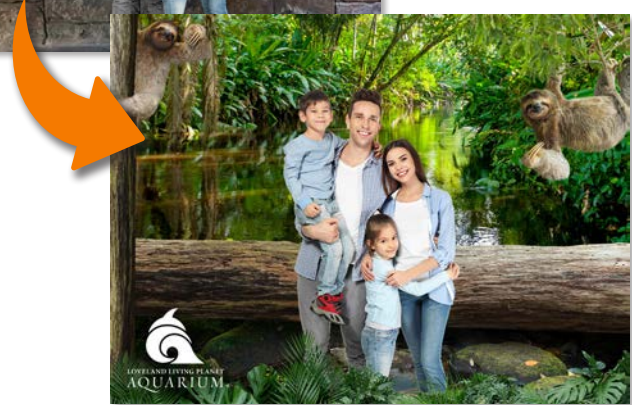
6" x 8" Postcard size