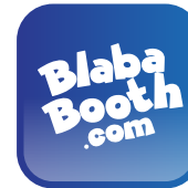
Photo gifts available from BlabaBooth.com